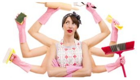
Breadwinning Mothers Carry the Mental Load at Home